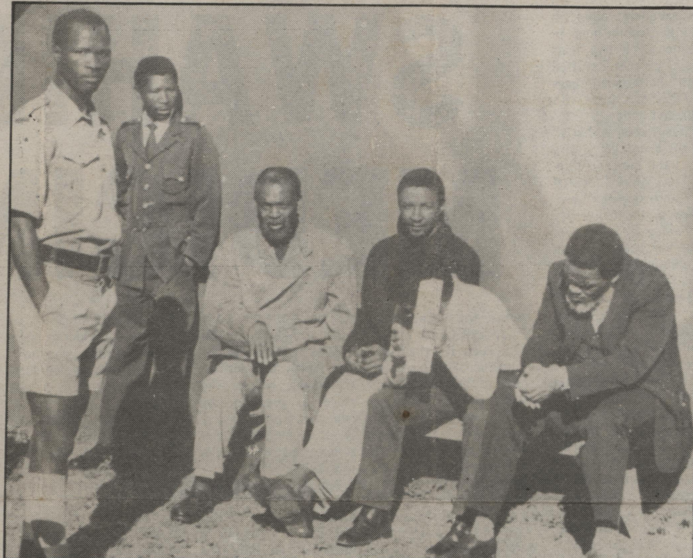
MURDER accused with prison warders pictured seated outside the High Court before their hearing. They are charged with the gory murder of seven people who were shot then set alight at Ekupheleni last Christmas.